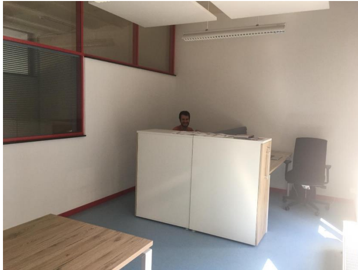
Figure 1.2 Photo of the CIVIS Representation Office

The Representation Office will be a valuable tool to facilitate the sharing of information within CIVIS, for building up a visibility as an essential actor of the “European Universities” landscape and for the coordination of the implementation of the CIVIS dissemination plan.