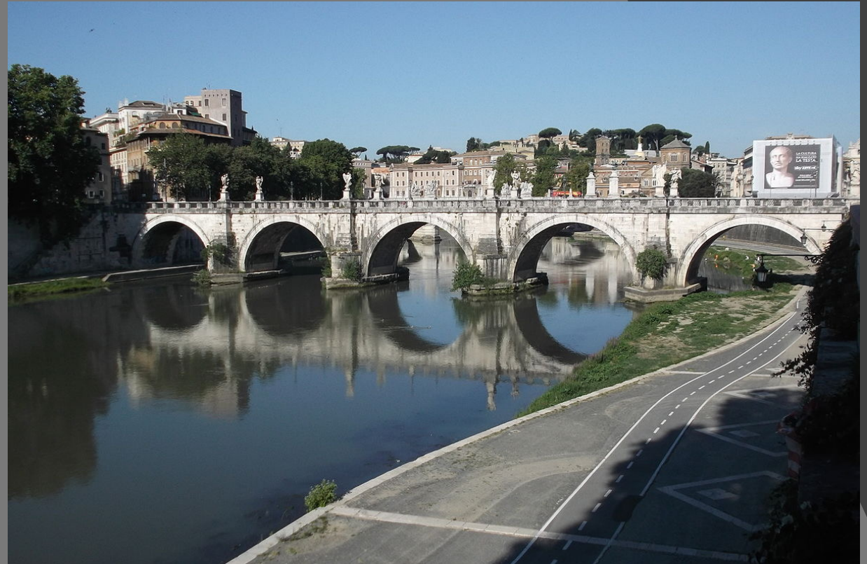
Rome, the Tiber River at Sant'Angelo bridge. Sergio D'Affitto, 2015. Creative Commons CC-BY-SA-4.0